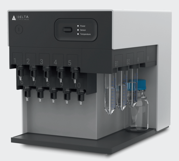
Figure 2. inQuiQ<sup>™</sup> instrument.